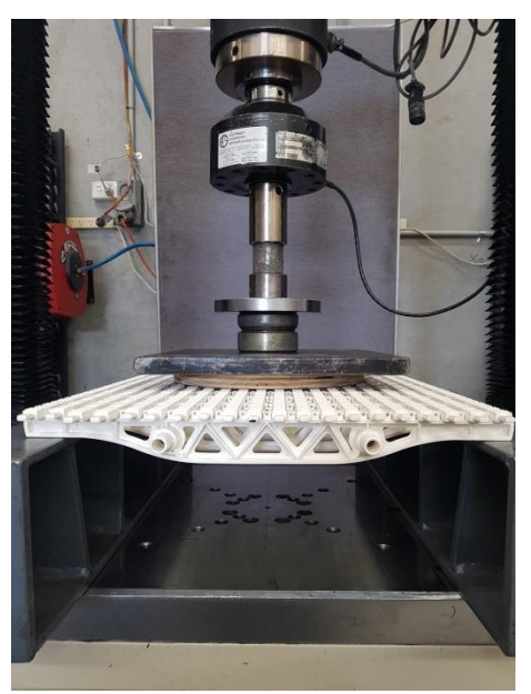
FIG. 2 Grate Test Set-Up

The Ultimate Limit State (ULS) test immediately followed completion of the SDL test and was conducted in accordance with AS 3996 - 2006 CLAUSE C4.7. The ULS load of 10 kN , as specified by TABLE 3.1 of AS 3996 - 2006 for Class A covers, was applied at a constant rate of 1 kN/s to the centre of the grate and held for a period of 30 seconds. The test load was then removed and the grate was inspected for visible signs of cracking, collapse or other similar forms of structural failure.