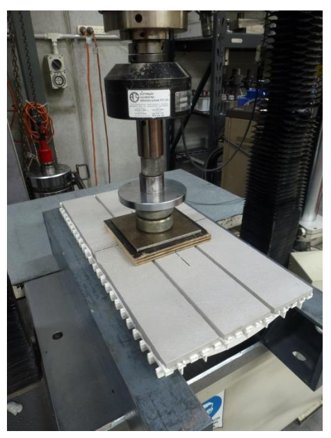
FIG. 2 Grate Test Set-Up

The Ultimate Limit State (ULS) test immediately followed completion of the SDL test and was conducted in accordance with AS 3996 - 2006 CLAUSE C4.7. The ULS load of 10 kN , as specified by TABLE 3.1 of AS 3996 - 2006 for Class A covers, was applied at a constant rate of 1 kN/s to the centre of the tiled grate and held for a period of 30 seconds. The test load was then removed and the specimen was inspected for visible signs of cracking, collapse or other similar forms of structural failure.