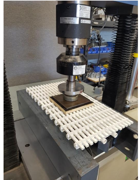
FIG. 2 GRATE TEST SET-UP

Serviceability Design Load (SDL) testing was conducted in accordance with AS 3996 CLAUSE C4.5 and C4.6. Prior to testing, the displacement transducers were balanced to establish a deflection datum. Test load was applied at a rate of 1 kN/s until the SDL of 6.7 kN was achieved, as specified by TABLE 3.1 of AS 3996 for Class A covers. After maintaining the SDL for five (5) seconds, the change in deflection at the centre of the test cover was recorded and the test force removed. Following removal of the SDL, any permanent deformation of the grate was logged. This process was repeated a total of five (5) times as per the requirements of AS 3996 – 2006 CLAUSE C4.3.