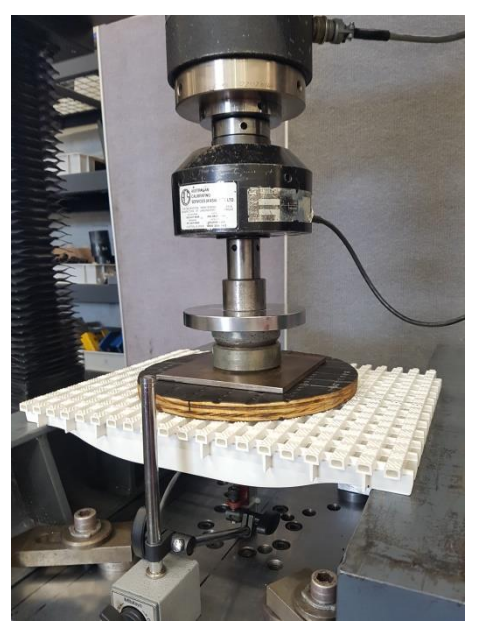
FIG. 2 Grate Test Set-Up

The Ultimate Limit State (ULS) test immediately followed completion of the SDL test and was conducted in accordance with AS 3996 - 2006 CLAUSE C4.7. The ULS load of 10 kN , as specified by TABLE 3.1 of AS 3996 - 2006 for Class A covers, was applied at a constant rate of 1 kN/s to the centre of the grate and held for a period of 30 seconds. The test load was then removed and the grate was inspected for visible signs of cracking, collapse or other similar forms of structural failure.