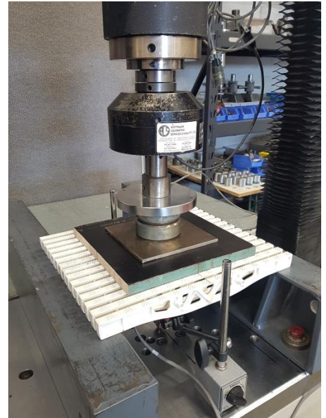
FIG. 2 GRATE TEST SET-UP

Serviceability Design Load (SDL) testing was conducted in accordance with AS 3996 CLAUSE C4.5 and C4.6. Prior to testing, the displacement transducers were balanced to establish a deflection datum. Test load was applied at a rate of 1 kN/s until the SDL of 6.7 kN was achieved, as specified by TABLE 3.1 of AS 3996 for Class A grates. After maintaining the SDL for five (5) seconds, the change in deflection at the centre of the test cover was recorded and the test force removed. Following removal of the SDL, any permanent deformation of the grate was logged. This process was repeated a total of five (5) times as per the requirements of AS 3996 – 2006 CLAUSE C4.3.