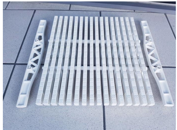
FIG. 1 'PERPENDICULAR' POOL GRATE COMPONENTS AS DELIVERED

Upon arrival at the laboratory the following details and nominal dimensions were recorded: